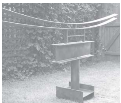
No. 22 East West