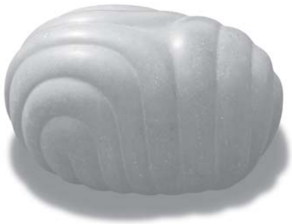
No.5 By Another Ocean II

"There she was just a-walking down the street, Singin' Doo Wah Diddy diddy dum diddy doo."