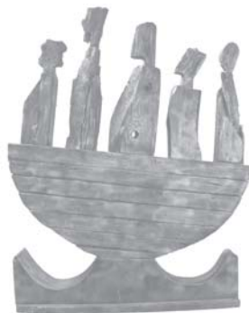
No.57 The Skellig Boatmen

This is the wooden original for a bronze inspired by the Skellig Islands seven miles off the south-west coast of Ireland, one of which was home to a community of monks from the 7th-12th centuries. Even now there are only a few days a year when a boat can land.