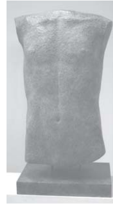
No.10 Classical Torso

Based on a hound from the 11th century Bayeux tapestry.