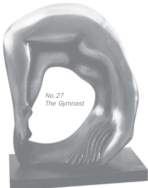
No. 27 The Gymnast

A Japanese symbolic Tojii gate might have suggested this title.