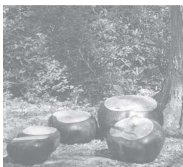
No. 39 Giant Conkers