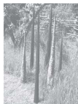
No. 43 Merecones