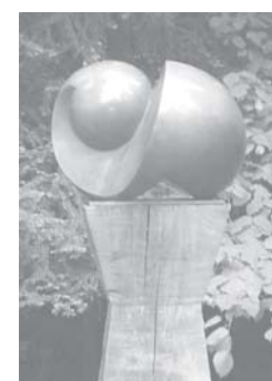
No. 44 Split Sphere